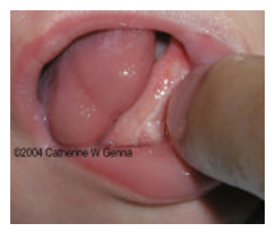
Bunched tongue tie