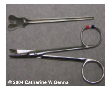
Grooved director and blunt Metzenbaum scissors.