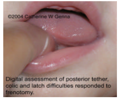
Types 3 and 4 may require a digital exam

Types 1 and 2, considered "classical" tongue-tie, are the most common and obvious tongue-ties, and probably account for 75% of incidence. Types 3 and 4 are less common, and since they are more difficult to visualize are the most likely to go untreated.