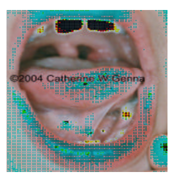
Untreated tongue-tie in an 11 year old child.